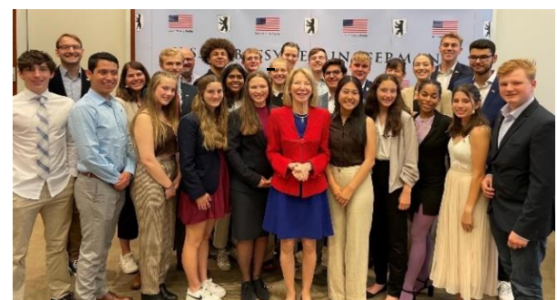
U.S. Ambassador Amy Gutmann, Berlin