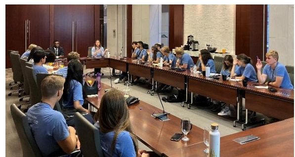
Center for Strategic and International Studies, Washington DC