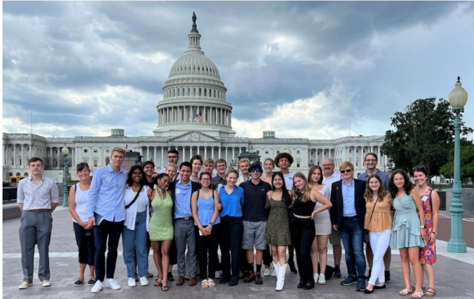
Congress Visit, Washington DC