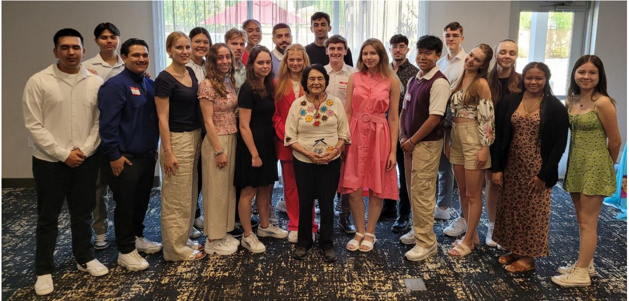
Dolores Huerta (Bakersfield)