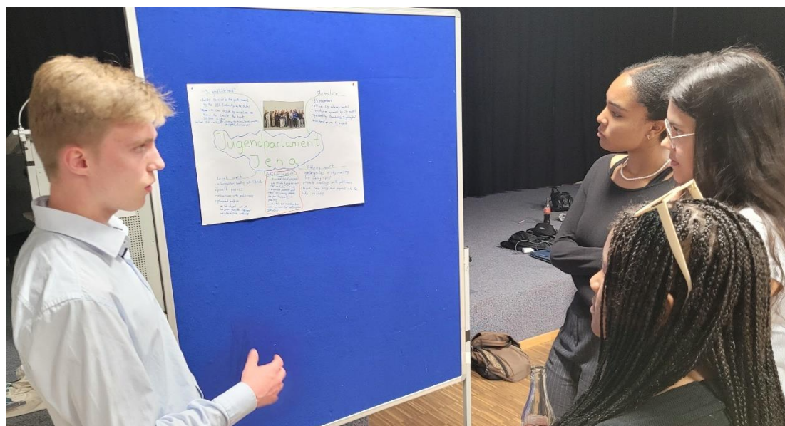
"Youth Council Fair:" poster presentations and discussion on youth participation in U.S. and Germany (Tuebingen)