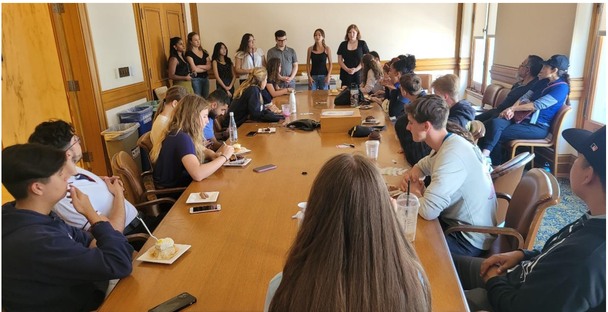
San Francisco Youth Commission (San Francisco)